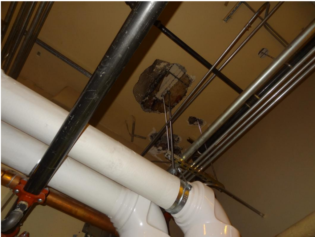
Data Center – FCA Building #0393 Description: Fire-rated ceiling in Mechanical Room is damaged.