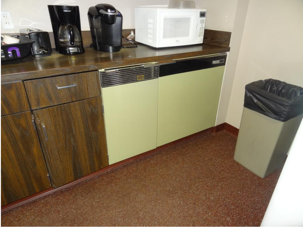
Data Center – FCA Building #0393 Description: Original employee break room.