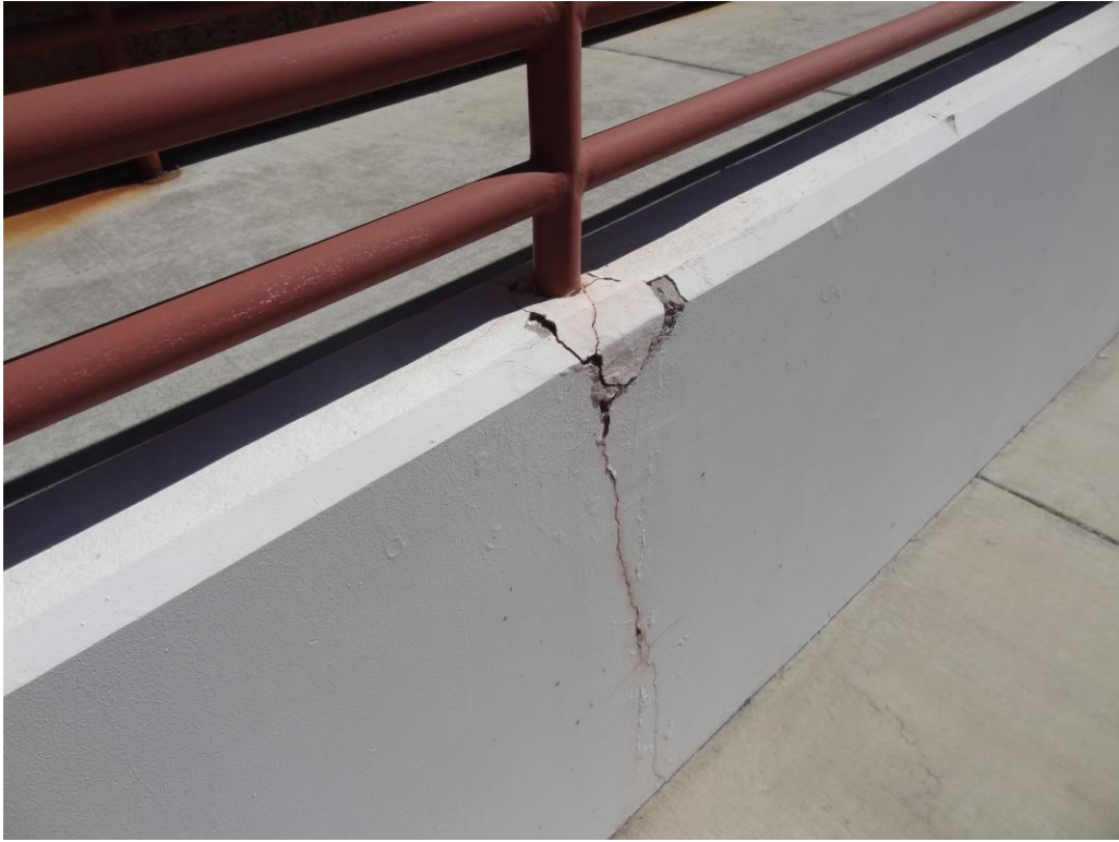
Data Center Site – FCA Site #9855 Description: Damaged concrete at exterior ramp.