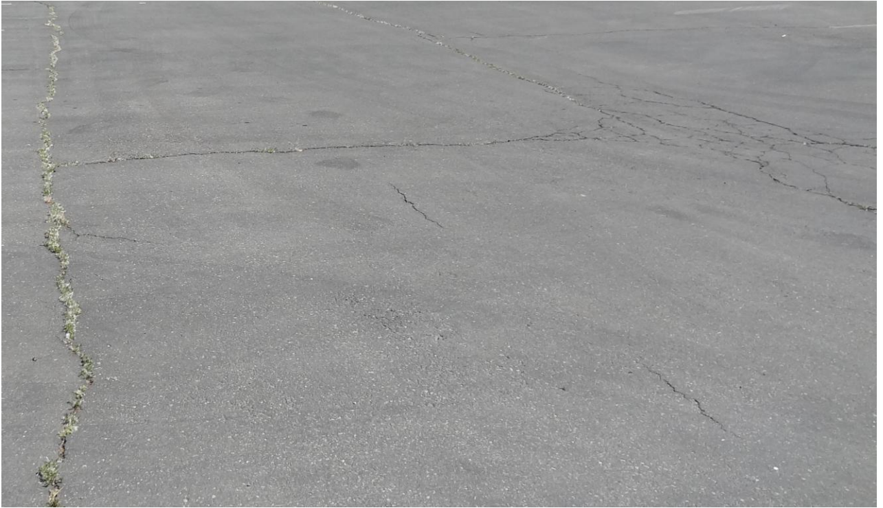
Data Center Site – FCA Site #9855 Description: Asphalt paving is cracked and alligatored.