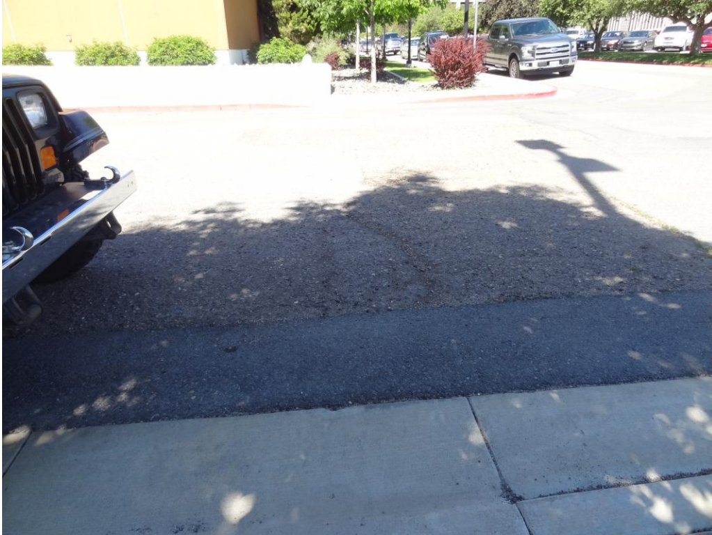
Data Center Site – FCA Site #9855

Description: ADA parking missing signage at loading zone and has faded striping.