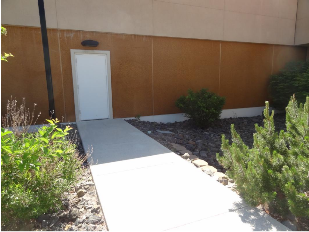
Data Center – FCA Building #0393 Description: Exterior finishes.