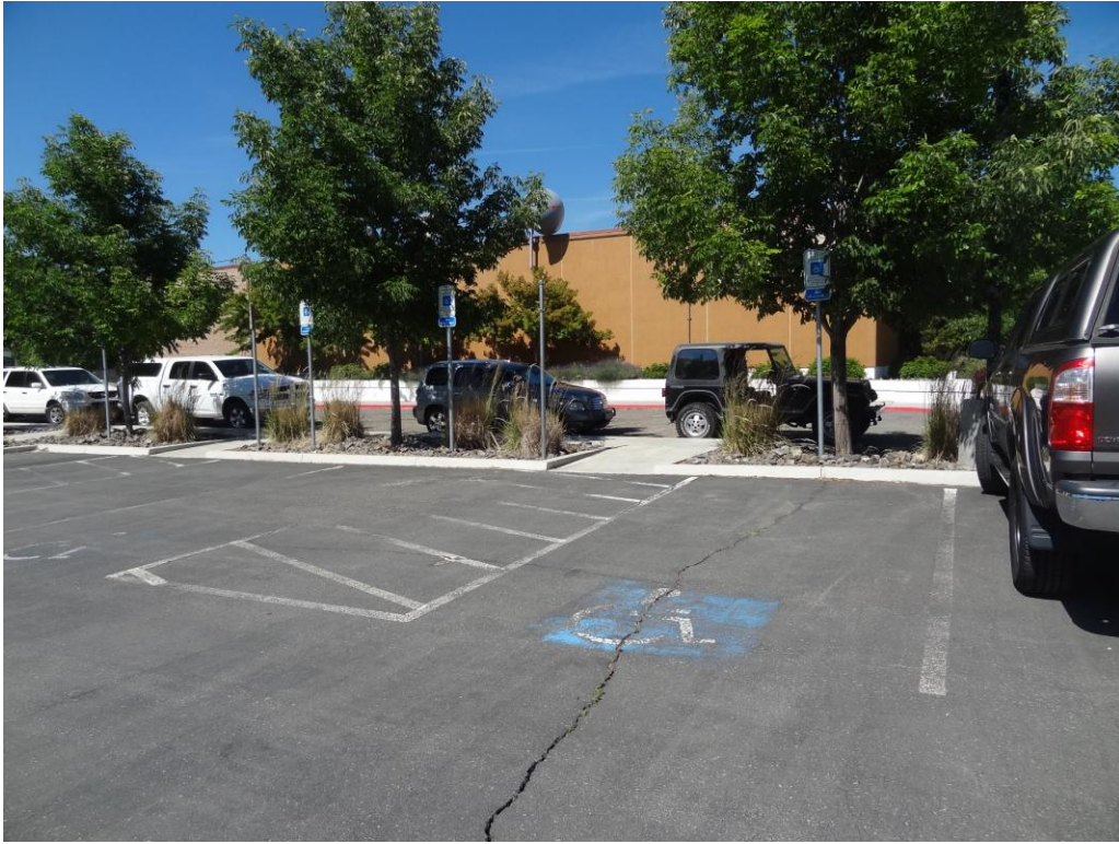
Data Center Site – FCA Site #9855

Description: ADA parking missing signage at loading zone and has faded striping.