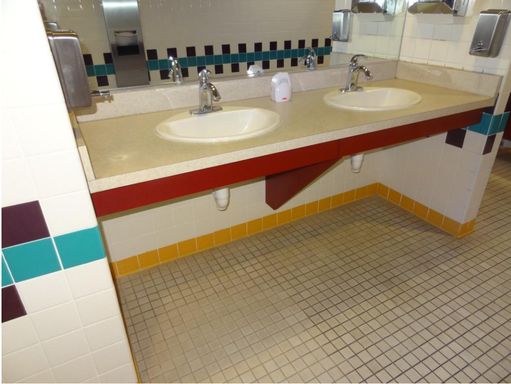
Data Center – FCA Building #0393 Description: 2"x 2" original floor tile in restrooms.