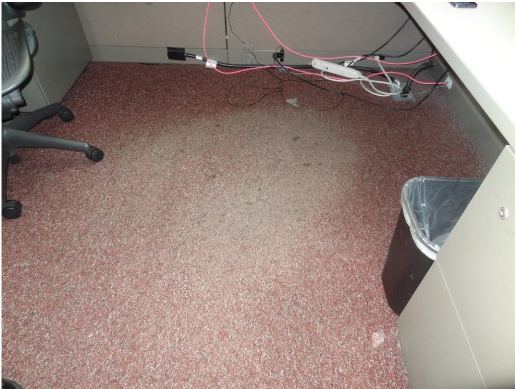
Data Center – FCA Building #0393 Description: Typical condition of carpet.