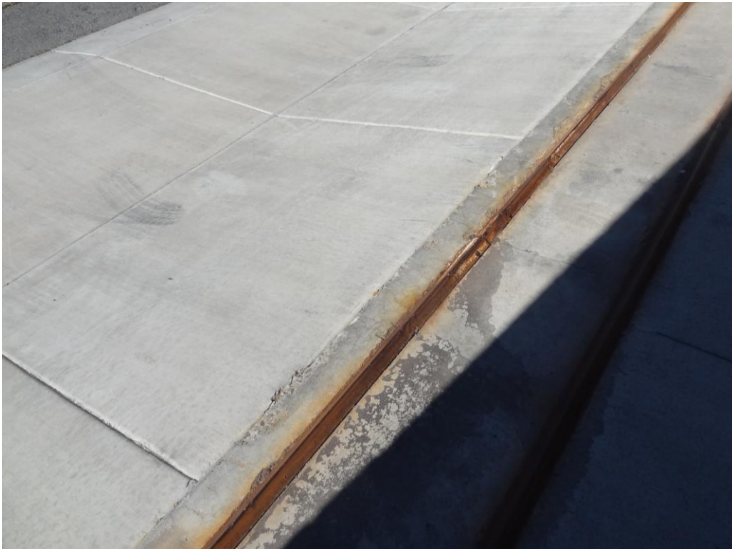
Data Center Site – FCA Site #9855 Description: Extreme slope on approach to loading dock.